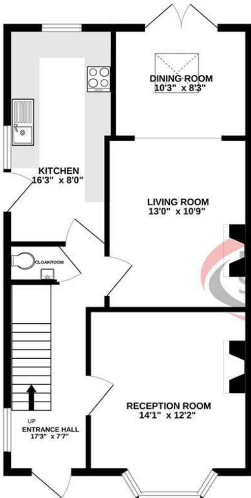
1ST FLOOR 449 sq.ft. approx.